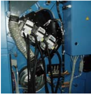
UV final dryer: Almost invisible when mounted: Interchangeable UV cassettes in the sheet ascent of a KBA 205.