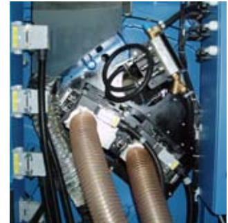
Same mounting position, different drying system: In this case, two IR hot air dryers are mounted in the sheet ascent for conventional drying.

the quality of cooling, usually an air/water combination. Therefore, you should also consider the efficiency of your cooling systems, which are normally placed beside the press and somewhat hidden. UV drying is a hot business that calls for rugged design in the component parts of drying elements, especially with extra-large formats, where the full capacity of drying cassettes is required at a span of more than 2 meters without sagging – that is, excellent cooling technology acting in a very confined space. Since running up UV dryers is harmful to the UV